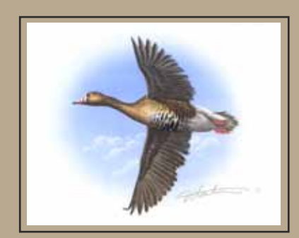
Example of a color remarque on a President's Edition print.

A remarque is a small original work of art. Each one is hand-drawn or painted with painstaking detail by the artist on the margin of your print. Each is unique. Executive and President's edition prints are an exciting way to obtain an original work of art that perfectly compliment your duck stamp print.