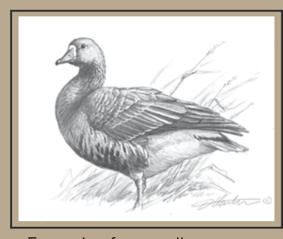
Example of a pencil remarque on an Exeutive Edition print.